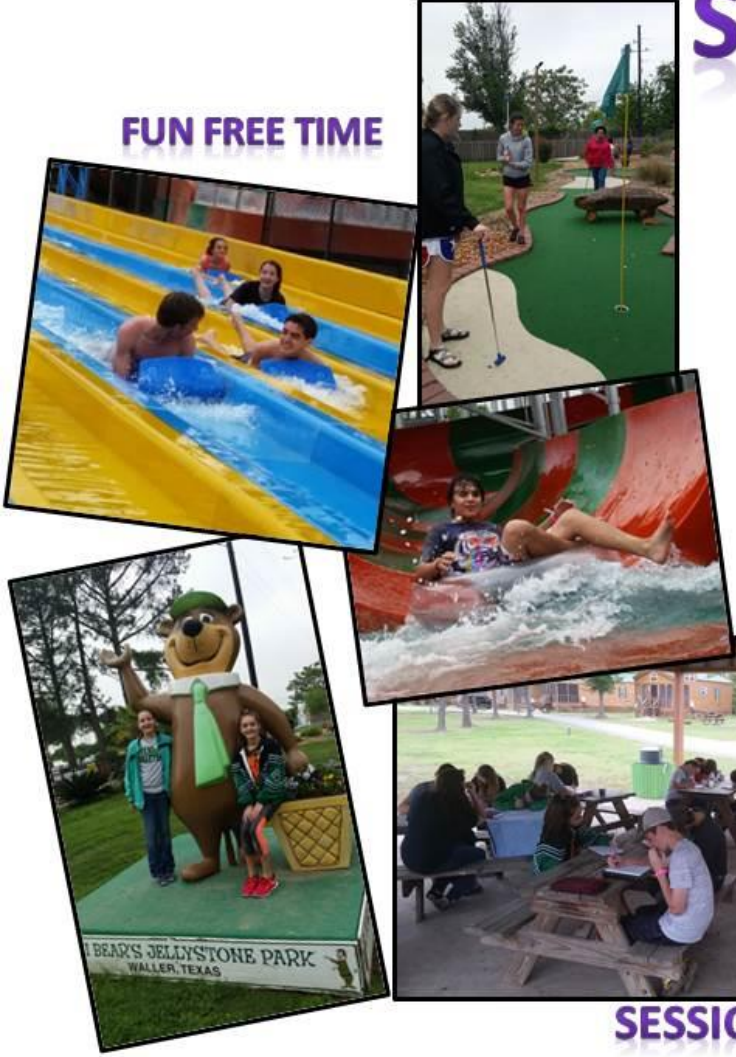
FUN FREE TIME